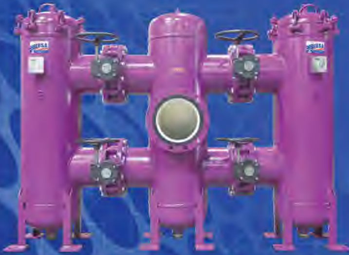
20" Fabricated Duplex Strainer with Internal Epoxy Coating shown

Fabricated Duplex strainers are required when an off-the-shelf solution will not meet your exact piping requirements. All of our Fabricated Strainers are made right here in the USA, at our state-of-the-art facility in the southeastern part of North Carolina.