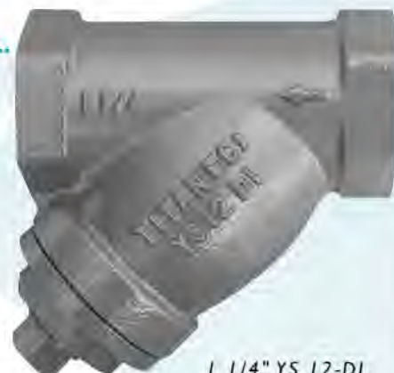
1 1/4" YS 12-DI