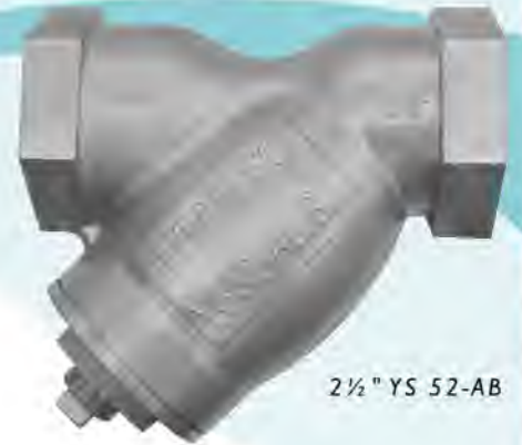
2 1/2" YS 52-AB