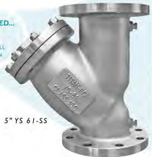
5" YS 61-SS

STANDARD ON ALL YS 61 MODELS IN SIZES 2" ~ 24"