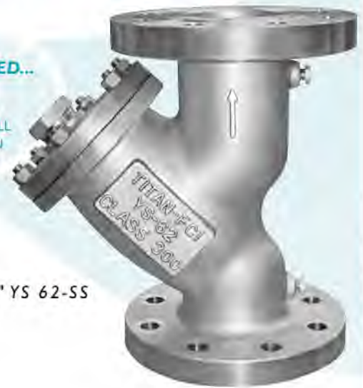
6" YS 62-SS

STANDARD ON ALL YS 62 MODELS IN SIZES 2" ~ 12"