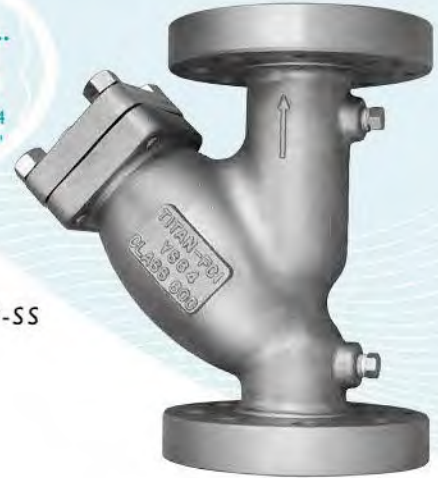
2" YS 64-SS

STANDARD ON ALL YS 64 MODELS IN SIZES 2" ~ 12"