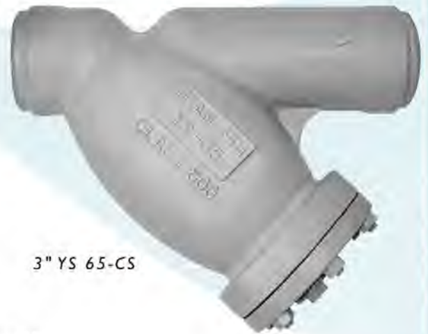
3" YS 65-CS