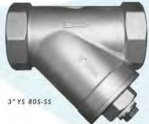
3" YS 80S-SS